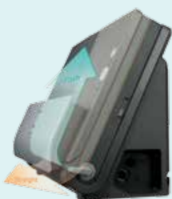
Unique vertical J-Path design

The vertical J-Path design allows documents to be fed and received vertically, so no extra desk space is required. Side-mounted cables and ports let you place both devices directly against a rear wall, or even on a shelf, for the ultimate in space-saving convenience.