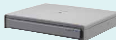
A3 Flatbed Scanner unit 201