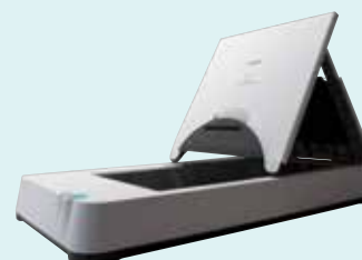
A4 Flatbed Scanner Unit 101

Scan bound books, journals and fragile media by adding the Flatbed Scanner Unit 101 for documents up to A4 or Flatbed Scanner Unit 201 for A3 scanning. Connected by USB, these flatbed scanners work seamlessly with the DR-C225 (only) in a smooth dual-scanning operation that lets you apply the same image-enhancement features to any scan.